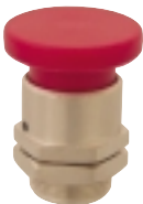
Part No. Description PC-3M-(color) . . . 5/8-32 Thd., Mushroom (specify color)