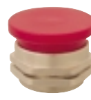
Part No. Description PC-5M-(color) . . . 5/8-32 Thd., Mushroom (specify color)