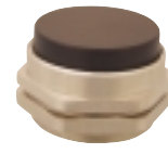
Part No. Description PC-5E-(color) . . . 5/8-32 Thd., Extended (specify color)