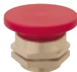
Part No. Description PC-4M-(color) . . . 7/8-32 Thd., Mushroom (specify color)