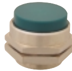
Part No. Description PC-4E-(color) . . . 7/8-32 Thd., Extended (specify color)